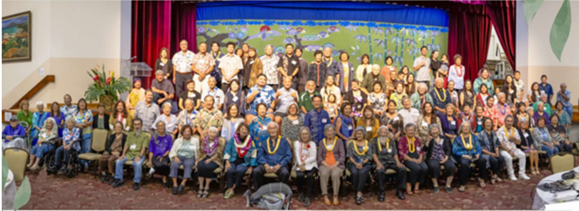
30th Anniversary and Bonenkai at the Hawaii Okinawa Center. Saturday, November 18, 2023.

We link our past to perpetuate our heritage